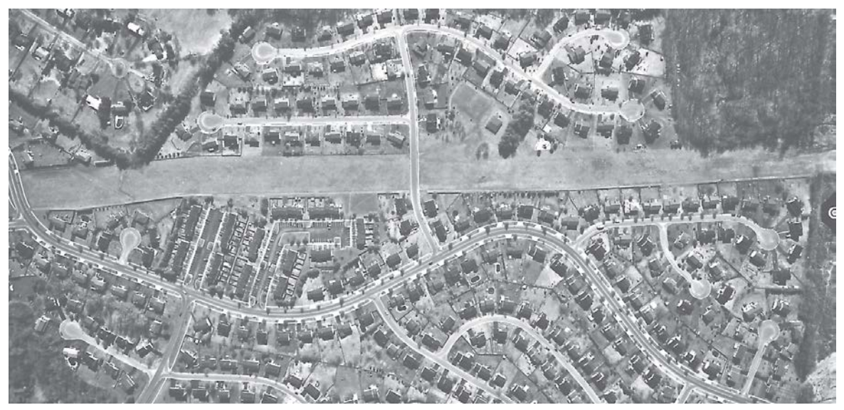
Aerial view of ideal easement in developed area