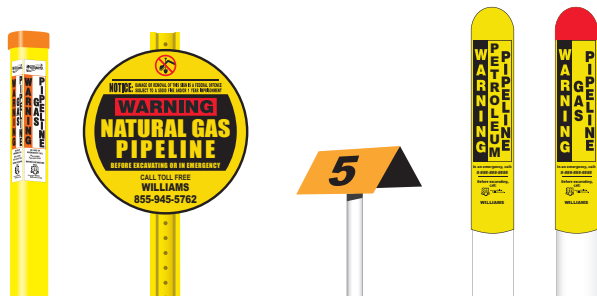
Permanent pipeline marker examples

Pipeline markers are found within the pipeline right-of-way.